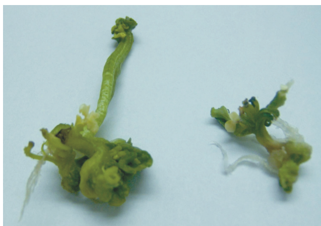
Fig. 3. Malformed shoots, primordia and roots formed on the organogenic callus

greenish-yellow colour in case of both unorganized leaf callus and organized cotyledon callus.