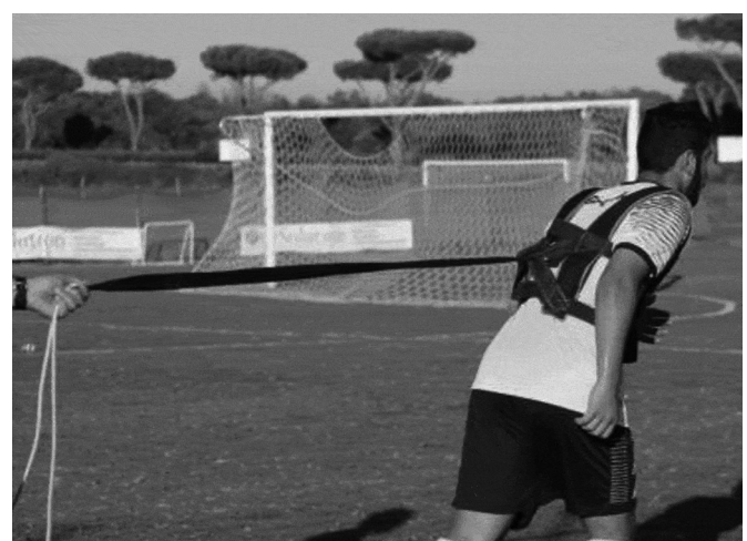
FIG. 2. Resistance-sprint harness