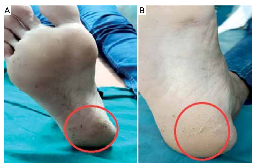
Figure 4. Multiple mosaic plantar warts (on the sole of the foot – red circle) treated with intralesional MMR vaccine ( \mathbf{A} – pre-treatment, \mathbf{B} – after 3 treatment sessions – complete clearance)

number of sessions 2.5) as compared to MMR vaccine: (3.4 sessions) (p = 0.03). The results were comparable in other types of warts (p > 0.05).