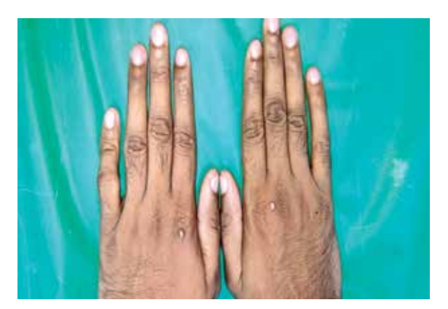
Figure 1. Intralesional vitamin D_3 – pre-treatment clinical photographs of verruca vulgaris on the bilateral dorsal hands

A significantly faster response was seen among cases of filiform warts treated with vitamin D_a (mean