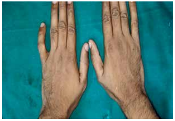
Figure 2. Intralesional vitamin D_3 – verruca vulgaris on the bilateral dorsal hands after 3 treatment sessions showing complete clearance