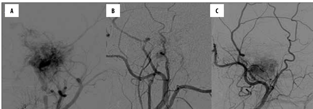
Figure 3. Left external carotid injection (A) presents a jugulo-tympanic paraganglioma tumoral blush. Two-staged embolization was performed with a subtotal effect of vascular occlusion (B). A control angiogram taken 13 months later revealed significant tumor revascularization (C).

is not curative [3,6,12]. As regards preoperative embolization through feeding vessels, its role is to decrease blood loss during surgical procedures and to help perform resections in a more secure manner [12–15]. In case of head and neck paragangliomas, both transarterial embolization with polyvinyl alcohol (PVA) particles and direct percutaneous embolization with n-butyl cyanoacrylate (NBCA) or ethylene vinyl alcohol polymer (Onyx) are used [16]. Either way, the procedure of presurgical adjuvant endovascular embolization is safe and effective, and the application of this form of therapy followed by surgical excision of paragangliomas is widely accepted [3,8,17]. In the literature, symptomatic treatment of paragangliomas is reported to be an alternative [3,6]. Paragangliomas are well-vascularized tumors and as a palliative treatment endovascular occlusion of tumor arterial supply is reported to have a positive impact on clinical symptoms including vertigo and tinnitus [3,13,17]. However, because of the multitude of arterial feeders and