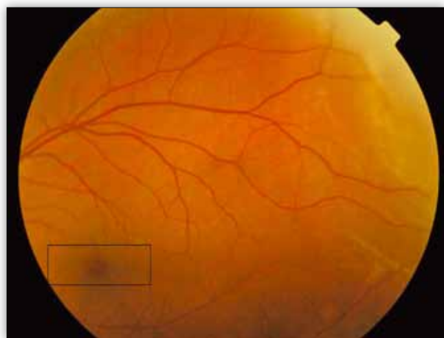
Fig. 1. The measurement area included a zone of 10 \times 2.5^\circ , that equals to 2.8 \times 0.7 mm. During each measurement the foveola was located in the central part of the scanned area. Retinal detachment is present in a superior-temporal part of the fundus.

We noted that the preoperative macular blood flow had a significant correlation with the extent of RRD ( p<0.05 ); the more extent area of RRD the lower macular blood flow was detected (Table I). No significant correlation was found according to the duration of RRD, refraction, number of retinal breaks and patient’s age.