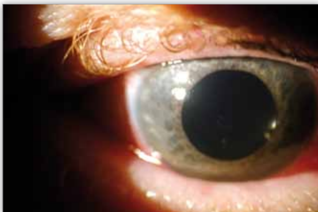
Fig. 2. Anterior segment of the right eye showing diffuse corneal edema, anterior chamber absent, dilated and non reacting pupil.

Ryc. 4. Przedni odcinek oka prawego 5 dni po interwencji chirurgicznej – utrzymująca się prawidłowa głębokość komory przedniej.