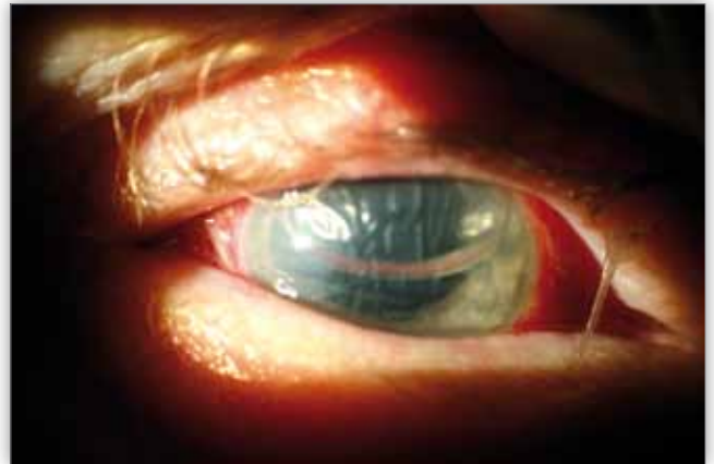
Fig. 3. Anterior segment photograph of the right eye twenty four hours after surgery showing well-formed anterior chamber with air bubble.

in the center. Fundus examination by the indirect ophthalmoscopy showed optic disc edema, retinal hemorrhages, dilated tortuous retinal veins and macular edema (Fig. 1).