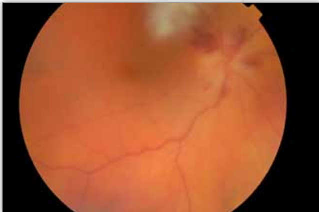
Fig. 1. Eye fundus before surgery with signs of central retinal vein occlusion.

Ryc. 3. Przedni odcinek oka prawego 24 godziny po operacji – komora przednia o prawidłowej głębokości z pęcherzykiem powietrza.